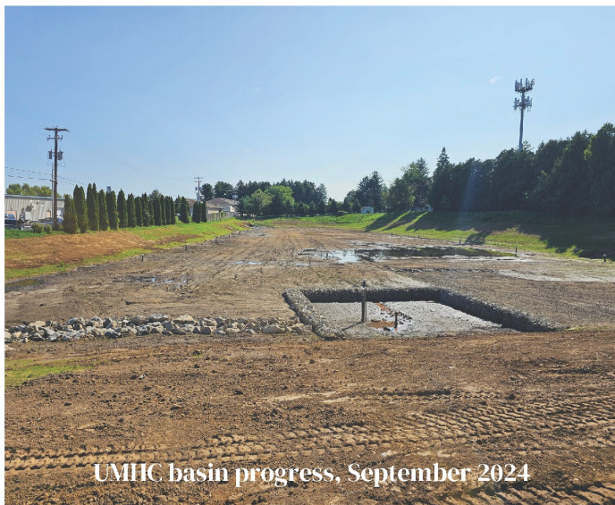
UMHC basin progress, September 2024