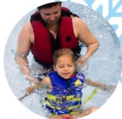
Youth Swim Lessons

Winter ~ Spring 2025 Registration is Here!